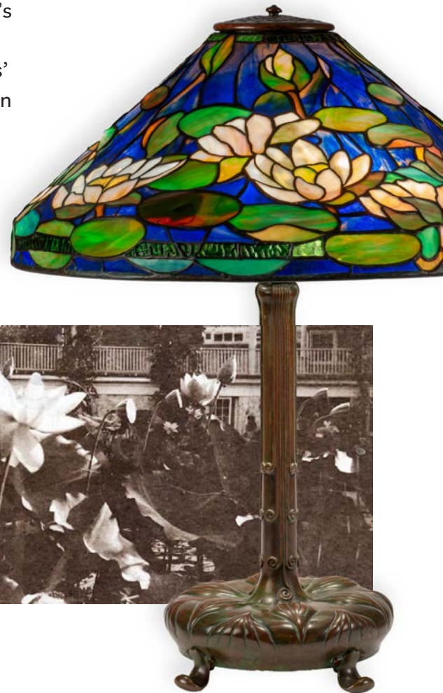
Grape Vine and Lemon Tree with Trellis window, W.15; Pond Lily Library Lamp , C.08; Lotus Flowers , archival photograph from the Tiffany Studios Study Photograph Collection, Courtesy of Private Collection

Perpetually in bloom, Tiffany's floral lamps and landscape windows embody his Studios' hallmark sophisticated design and exquisite craftsmanship.